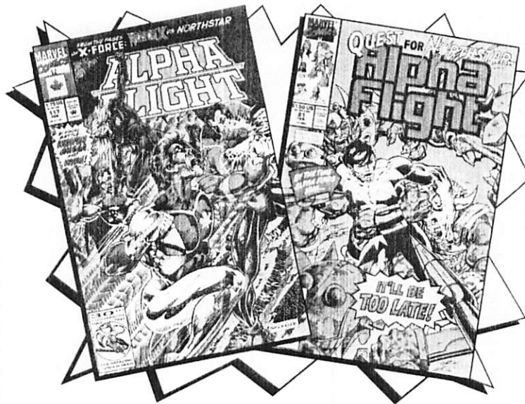
Marvel superhero "Northstar" courageously bursts out of the closet

In June of this year, Lightning Comics will debut a comic book featuring Bloodfire, a character described as having "superhuman strength, speed, endurance and the HIV virus." Strangely