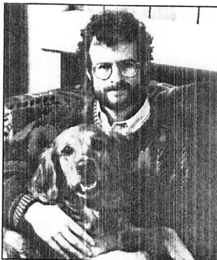
Shilts' book is filled with dubious research and anonymous sources